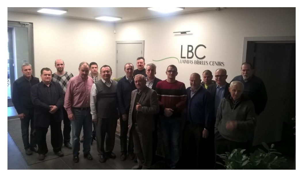
In Latvia, there are currently 22 Russianspeaking Baptist congregations. And there are about 90 Baptist churches in this country, with about 6,000 members. A small brotherhood.

In the seminar, I touched upon topics such as the mission of the Church, the role of the pastor in the congregation, the personal characteristics of pastors and the family of the pastor, and others. Among those present at the seminar were some brothers with whom we worked 30 years ago, when we were still living in Riga. It was nice to meet old friends. And also, there were those who accepted the Lord and became ministers of the church after we immigrated to America. For me, this opportunity to serve fellow-ministers in Latvia is very special. Fourteen special years of my life were spent here. Spiritual maturation after baptism (in Brest), marriage, birth of all our children, receiving and accepting the call for ministry—all this took place in this beautiful city of Riga. Many warm memories are associated with this place.